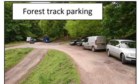
Forest track parking